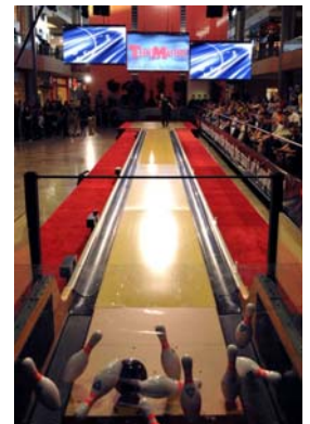
Showcase for the Sport!

Step 7 — Upload your logo if you selected the Gold sponsorship level. Please limit file to 250 KB.